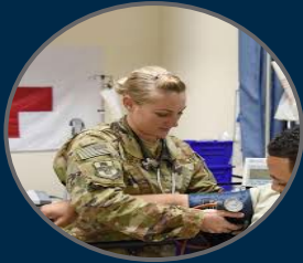
Ways to Serve